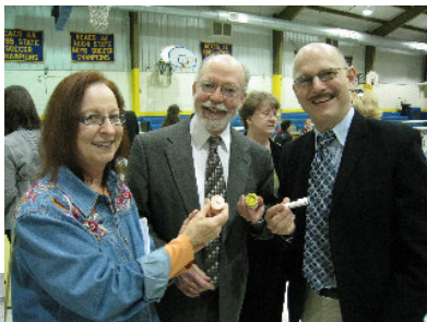
Friday night reception