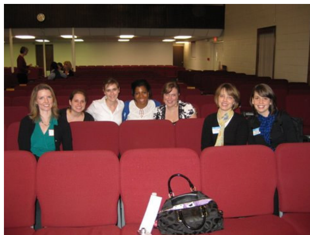
Happy flutists at the festival!